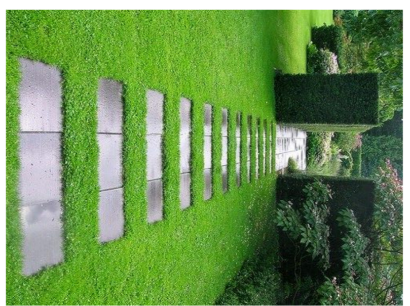
Stepping Stones through open space