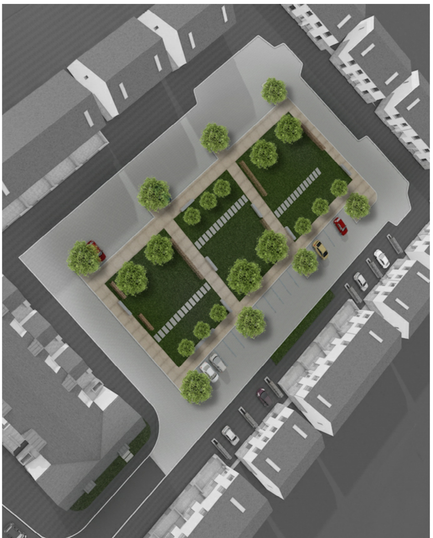
Home Zone Overview - Design Development Model