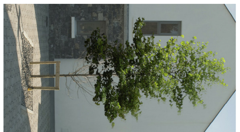
Guarding to trees